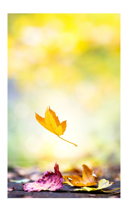
I wait for your Word to renew me.